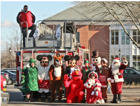
Fire Truck and Christmas Delivery's 2011